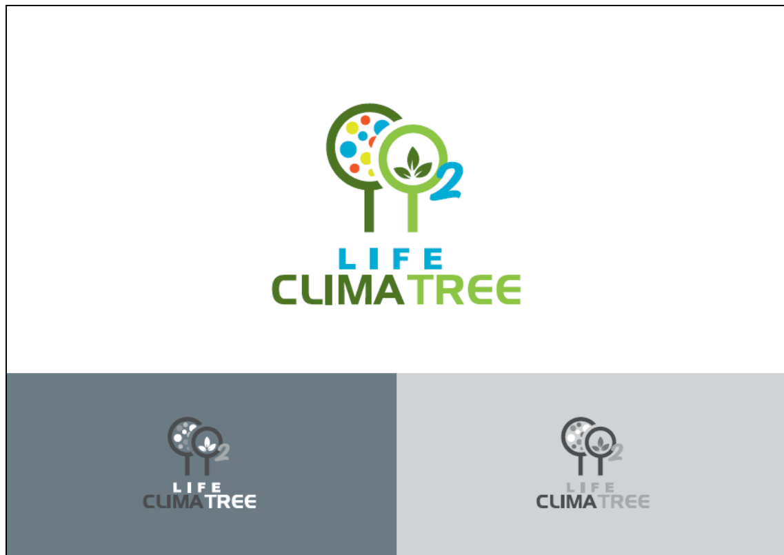
Figure 5: Selected LIFE CLIMATREE's logo in color, and grayscale