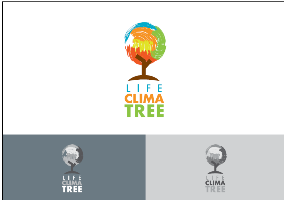
Figure 1: Alternative logo 1

The filled-in sheets collected during the Kick-off meeting were delivered to the graphic designer who created 5 alternative graphic designs of the project's logo. These alternative designs are presented below.