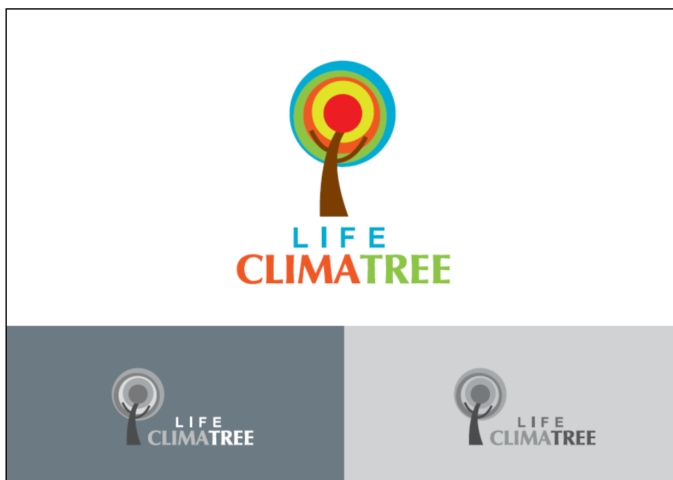
Figure 2: Alternative logo 2