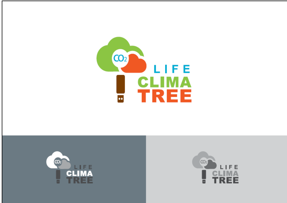
Figure 3: Alternative logo 3