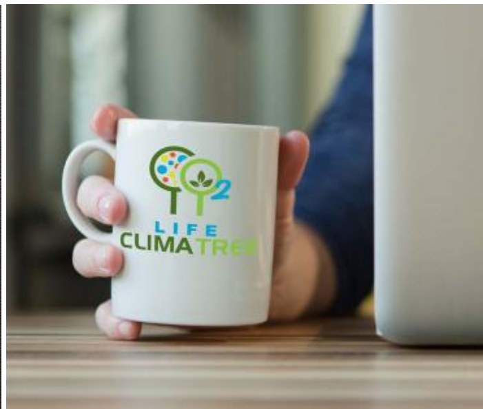
Figure 6: Demo applications of LIFE CLIMATREE's logo