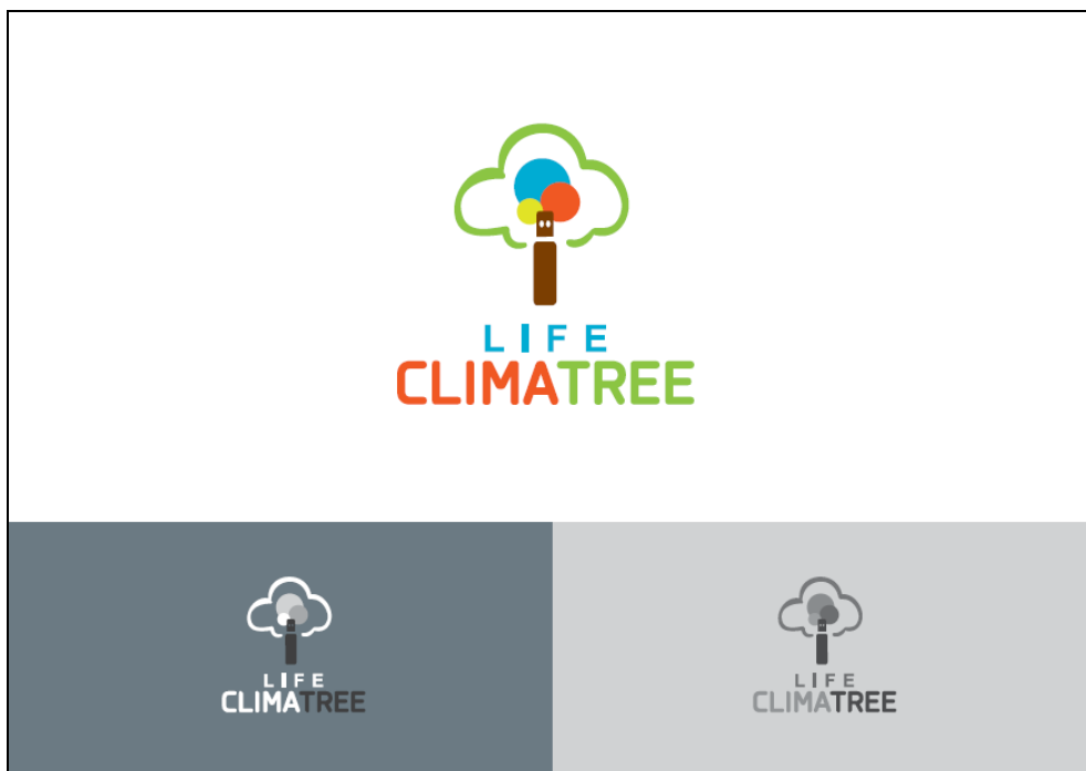
Figure 4: Alternative logo 4